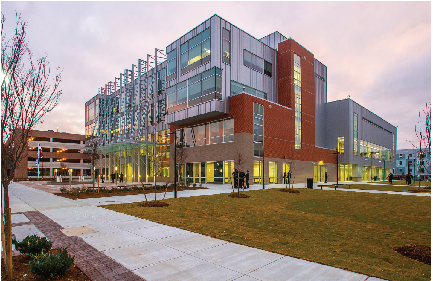
The HII Apprentice School in Newport News, Va.